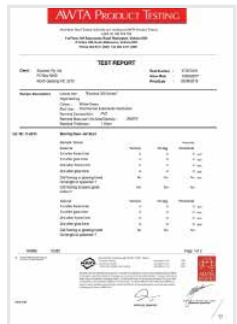
UL 181 Part 11