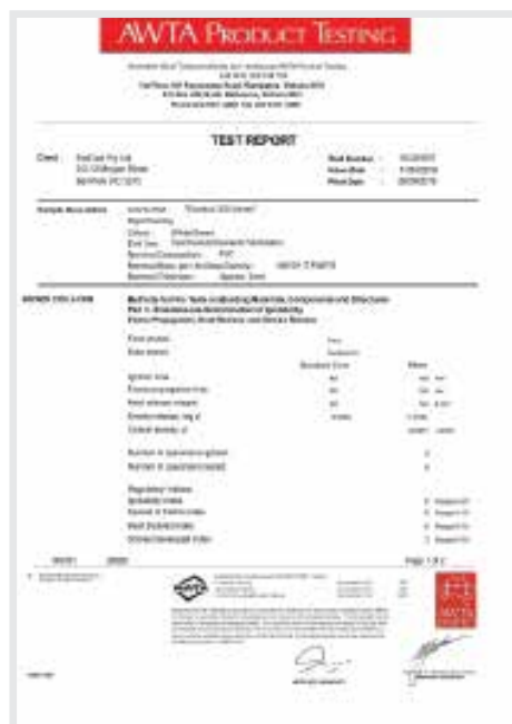
AS 1530 Part 3

ECODUCT is manufactured to comply with Australian Standard AS 4254.2 - 2012: Ductwork for air handling systems in buildings. 2.1.2 Rigid Ductwork. To comply with this requirement ECODUCT had to achieve a Smoke Developed Index not greater than 3, and a Spread of Flame not greater than 0 when tested to AS 1530 part 3. ECODUCT also had to comply with UL 181 Burning Tests as an assembled product.