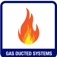
GAS DUCTED SYSTEMS

Westaflex CONNECT allows you to attach the irrigation control system and water your garden at anytime from anywhere in the world. The simple to use system uses IFTTT to allow you to water your garden based on the weather forecast in your area, which will save you time and money but most importantly will save precious water. The CONNECT irrigation controller comes standard with 8 stations however this can be increased to a maximum of 24 stations if required.