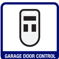
GARAGE DOOR CONTROL

Westaflex CONNECT smart plugs gives you the power to control or manage your domestic appliances from anywhere using your smart phone or tablet. Turn on your kettle using the schedule to have boiling water for your coffee or tea when you wake up, turn on your bed side light before you go to bed and then schedule it to go off at the time you desire. If you can plug it in, then you can control when it goes on and when it turns off. If you want to make adjustments, just open the app and adjust your schedules, its that easy.