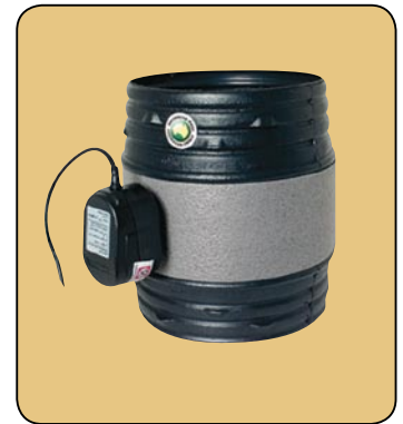
› Poly Motorised Zone Damper

b Optional - Manual damper blade set by installer maintains the exact amount of air required to service the area once zone damper is activated.