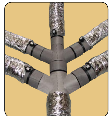
› Totem Pole Connecting System.

Utilising Poly Fitting, Poly Connector & Poly Motorised Zone Damper