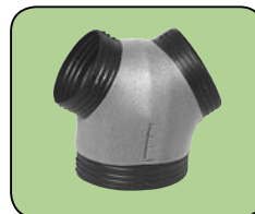
Code Prefix: 7121 Poly “Y” Insulated