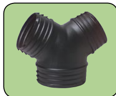
Code Prefix: 7120 Poly “Y” Plain